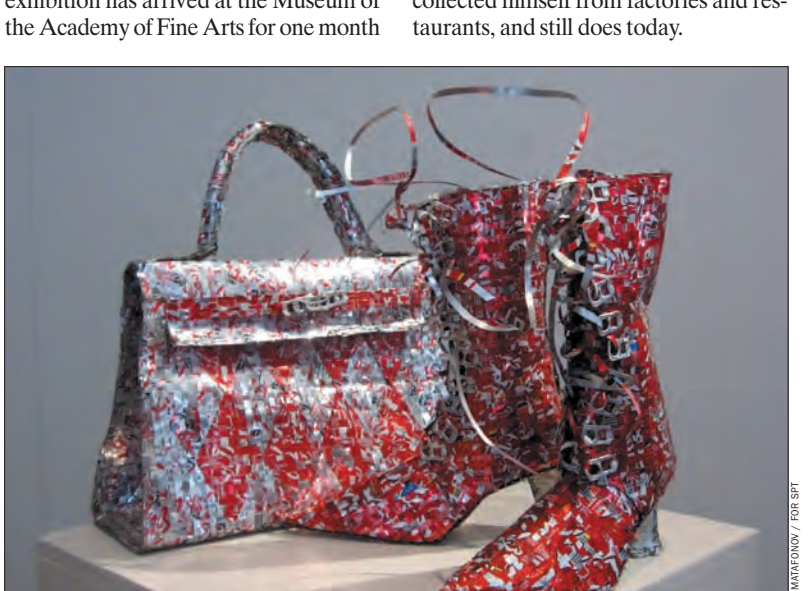
Intricate detailing complete the accessories inspired by Princess Grace Kelly.

Hand-cut, twisted, woven and shredded, Floros' technique with the aluminum is immediately impressive. While his collection, which includes a series of dresses, handbags, shoes and gloves, may not be to everyone's taste, you can't help but appreciate the work behind it especially the grand sculpture inspired by the wedding dress worn by Kelly for her marriage to Prince Rainier of Monaco. Created specifically to commemorate the 30th anniversary of the death of the princess, the remarkable dress took four years and over 4,000 diet coke cans to create — cans that Floros collected himself from factories and res-